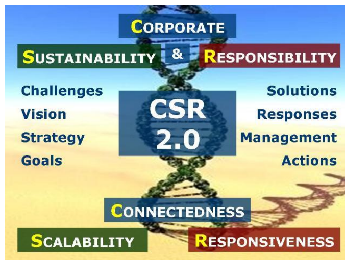
Figure 1: Corporate Sustainability & Responsibility (The New CSR)

The DNA of CSR 2.0 (Figure 2) can be conceived as spiralling, interconnected, non-hierarchical levels, representing economic, human, social and environmental systems, each with a twinned sustainability/responsibility manifestation: economic sustainability and financial responsibility; human sustainability and labour responsibility; social sustainability and community responsibility; and environmental sustainability and moral responsibility.