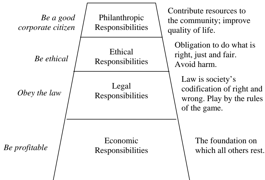
Figure 1: The Pyramid of Corporate Social Responsibility